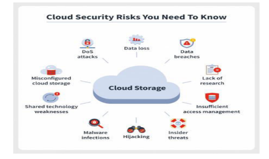
Figure 1: Securing the Cloud

Cloud security is a shared responsibility between cloud service providers (CSPs) and customers. While CSPs secure the infrastructure, customers must implement security best practices to protect their data and applications. This paper examines the critical security challenges in cloud computing and explores various strategies and technologies to mitigate these risks.